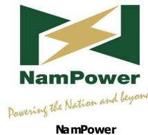
NamPower Powering the Nation and beyond NamPower